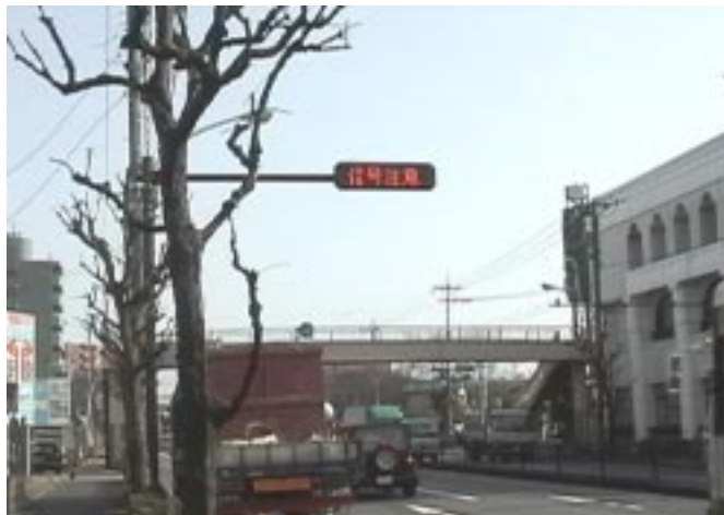
Figure 2. Traffic information board

Figure 2 shows Traffic information board, Figure 3 shows arrangement of terminal equipment in Honshiki intersection.