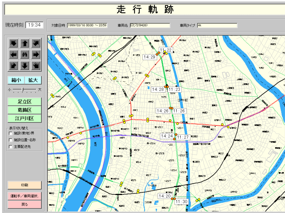
Fig. 3 Screen for tracing travel route

This screen displays the travel route traced by an assigned driver (vehicle name). “Pass time” is indicated at each beacon passed. The system can also give a response output by assigning ranges of object date, start time, and end time. When a truck passes a beacon several times, “pass times” are indicated on several lines.