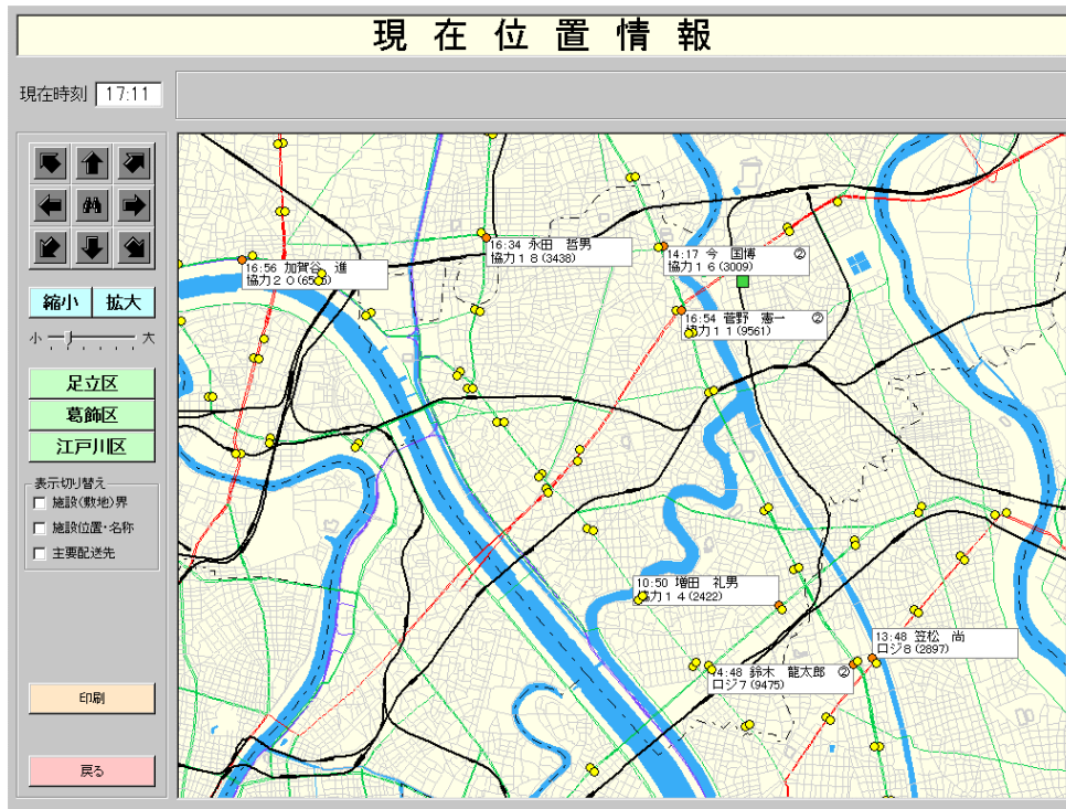
Fig. 2 Screen for current position information